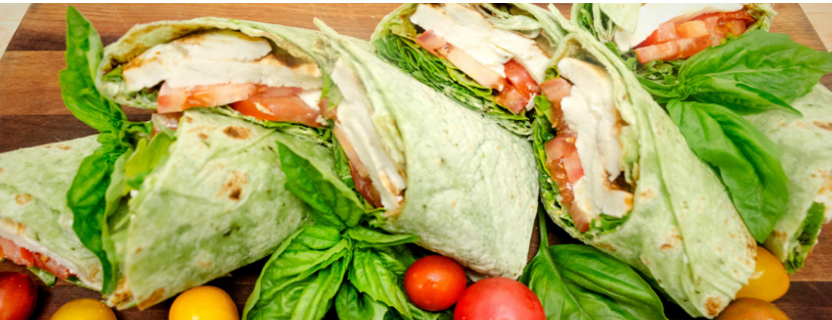
Caprese Vegetarian Wrap

buttered sourdough bread, herb boursin cheese mousse, fig jam marmalade, parma prosciutto, baby arugula