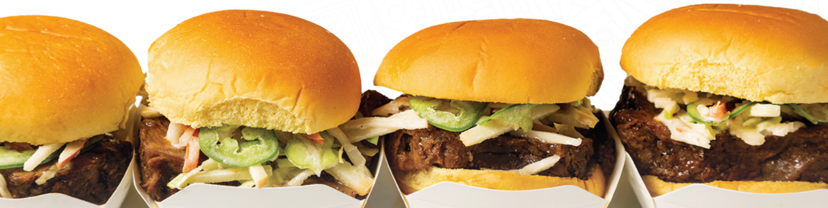
Cali BBQ Pulled Pork Sandwiches