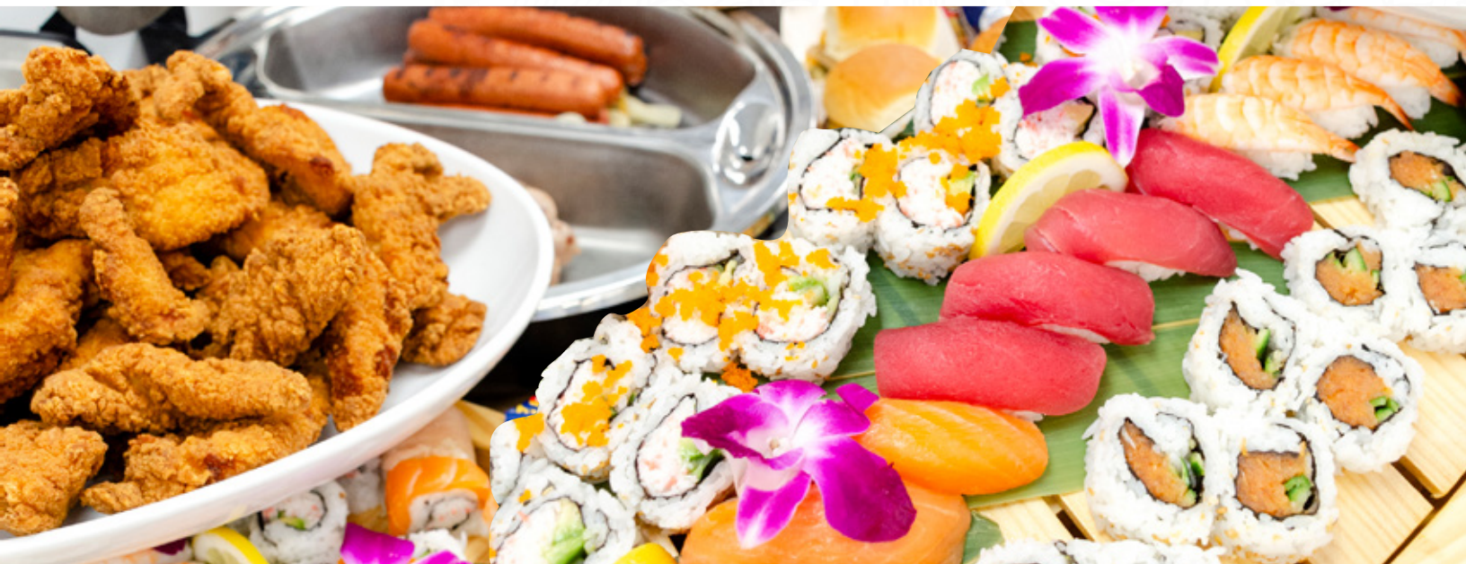
Prime Time Package