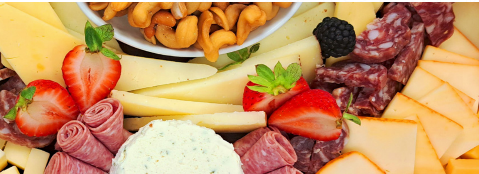
Cheese & Charcuterie

imported and domestic cheeses, cured meats, roasted nuts, pickles, assorted gourmet crackers