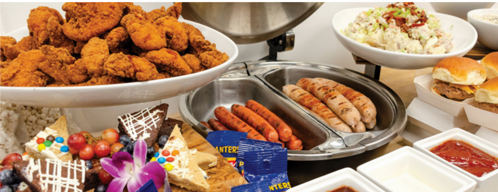
Game On! Package