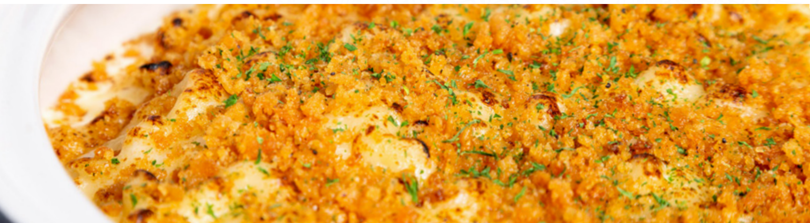
Baked Mac & Cheese

fried brussels sprouts, parmesan cheese, balsamic reduction, spiced pepitas