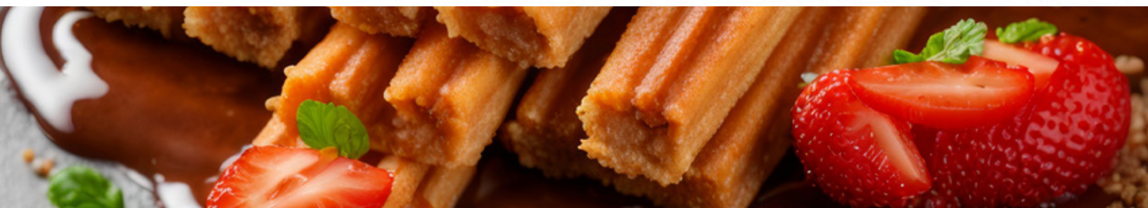
Churros with Trio of Sauces

Pre-order only. Cart will arrive with suite attendant who will scoop during a thirty minute window.