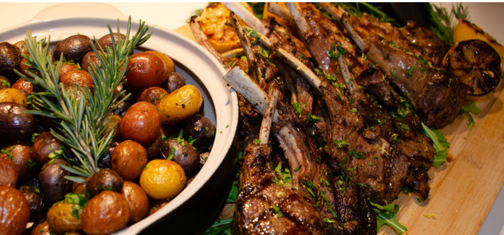
Mediterranean Lamb Lollipops

granny smith apple compote, flourless cake, bourbon maple glaze, micro mint