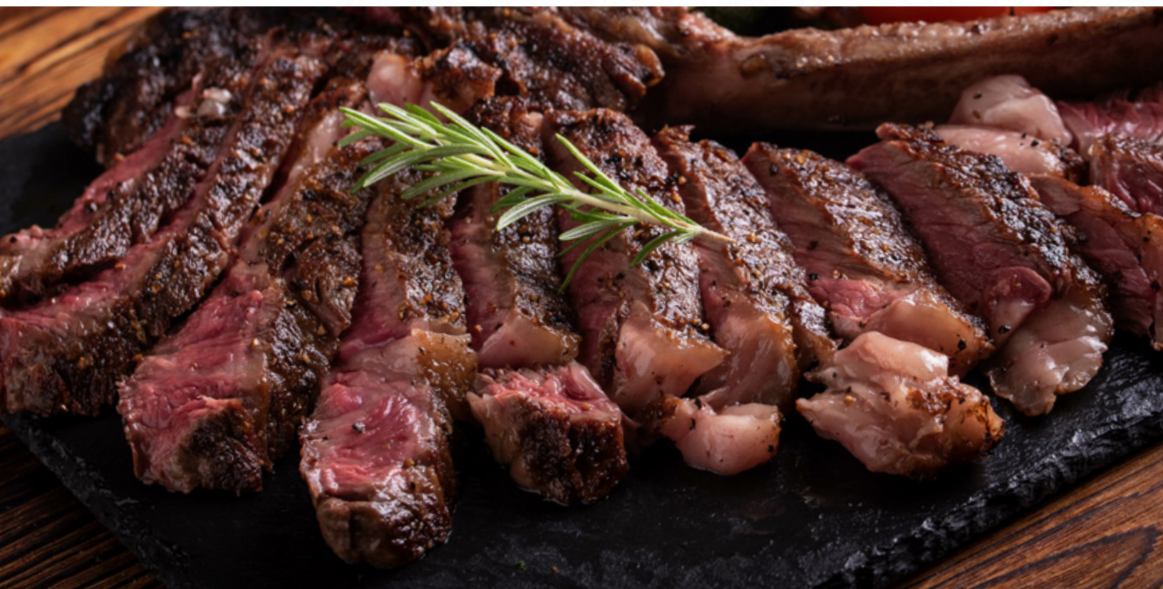
Herb Crusted Tomahawk

flourless cocoa cake, butterscotch mousse, banana compote, caramel glaze, chocolate crumble