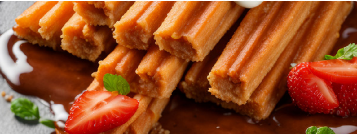
Churros with Trio of Sauces

For more information about our Menú Azteca