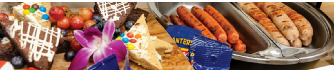
Game On! Package